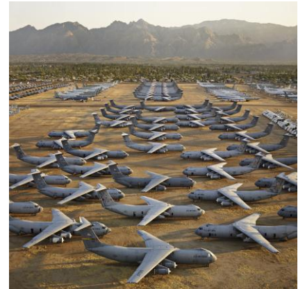
Edward Burtynsky, AMARC #5, Davis-Monthan AFB, Tucson, Arizona, USA, 2006. Chromogenic color print.

The McCord Museum thanks the Ministère de la Culture, des Communications et de la Condition féminine du Québec, the Conseil des arts de Montréal, and its partners Astral, La Presse and The Gazette, for their support.