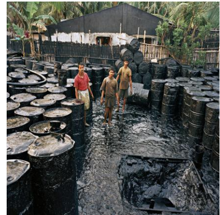
Edward Burtynsky, Recycling #2, Chittagong, Bangladesh, 2001. Chromogenic color print.